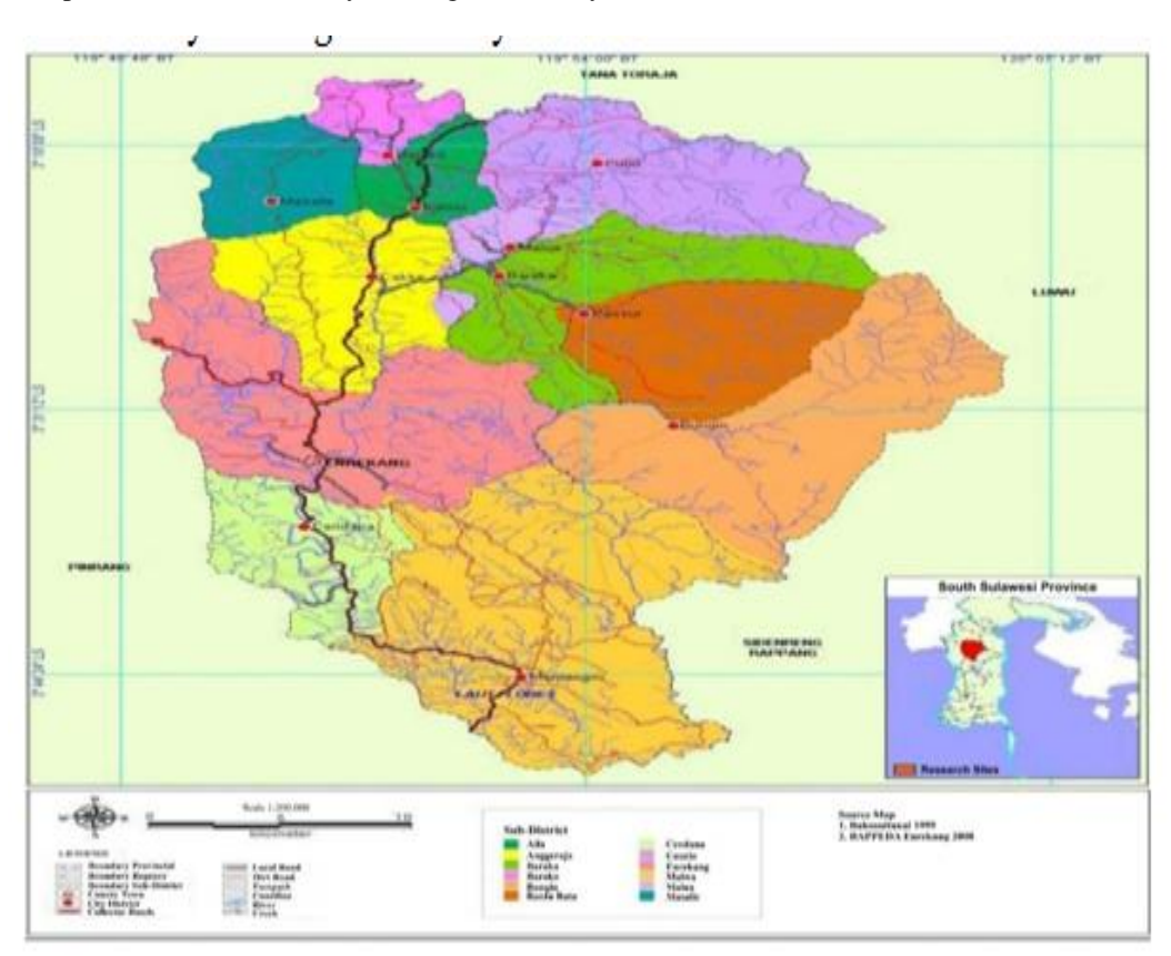
Figure 1. Administration Enrekang as the Object of the Study

Starting from that view, it is understood that the development of agropolitan area based on local economic potential will require the support of economic cooperation between actors in the system of rural agribusiness. Thus the ontological assumptions that are built in this paper, namely; (i) Belajeng agropolitan area will develop through a process of integration program and between economic actors, (ii) development process of Belajeng agropolitan area will require investment support from the financing of infrastructure and patterns of rural agribusiness ongoing basis, (iii) development of local economic potential is performed through the coaching effort and venture capital assistance for farmers that is integrated with the market system, (iv) construction and development of Belajeng agropolitan need support of empowerment of farmers, market access and increase in the institutional capacity of community, and (v) Belajeng agropolitan needs support in the development of economic base sectors as the leading according to the of local economic potential and agricultural product result worked by farming community.